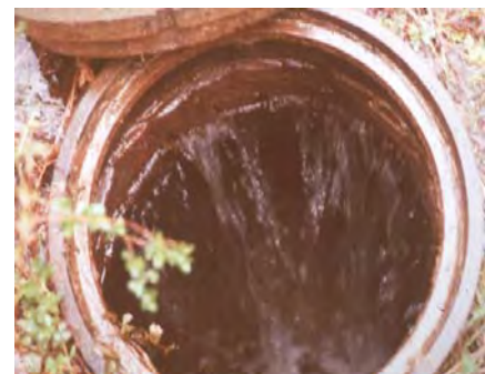
Inflow into a Manhole

Inflow is extraneous flow entering the collection system through point sources and may be directly related to storm water run-off from sources such as roof leaders, yard and area drains, basement sump pumps, ponded manhole covers, cross connections from storm drains or catch basins, leaking tide gates, etc. Inflow causes a rapid increase in wastewater flow that occurs during and continuing after storms and extreme high tides. The volume of inflow entering a collection system typically depends on the magnitude and duration of rainfall, as well as related impacts from snowmelt, flooding, and storm surge.