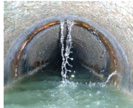
Infiltration in a Sanitary Sewer

Infiltration is groundwater that enters the collection system through physical defects such as cracked pipes/manholes or deteriorated joints. Typically, many sewer pipes and sewer service laterals are below the surrounding groundwater table. Therefore, leakage into the sewer (infiltration) is a broad problem that is difficult and expensive to identify and reduce.