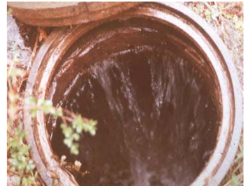
Inflow into a Manhole

Inflow is extraneous flow entering the collection system through point sources and may be directly related to storm water run-off from sources such as roof leaders, yard and area drains, basement sump pumps, manhole covers, cross connections from storm drains or catch basins, leaking tide gates, etc. Inflow causes a rapid increase in wastewater flow that occurs during and after storms. The volume of inflow entering a collection system typically depends on the magnitude and duration of a storm event, as well as related impacts such as snowmelt and storm tides.