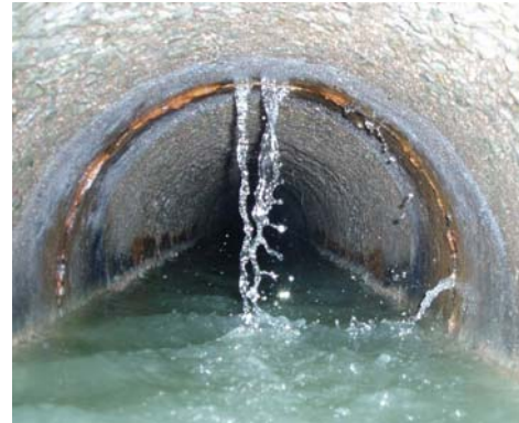
Infiltration in a Sanitary Sewer

Infiltration is groundwater that enters the collection system through physical defects such as cracked pipes/manholes or deteriorated joints. Typically, many sewer pipes and sewer service laterals are below the surrounding groundwater table. Therefore, leakage into the sewer (infiltration) is a broad problem that is difficult and expensive to identify and reduce.