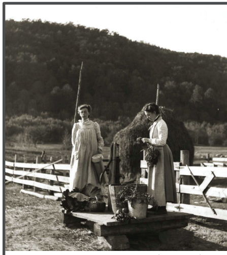
Washing vegetables at a pump (Greenwich)

Your community is investing in reliability as well. MWRA provides zero-interest loans to communities for pipeline rehabilitation and other water quality improvements. During 2023, we loaned $50 million to 17 communities for pipeline projects.