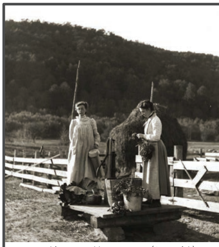
Washing vegetables at a pump (Greenwich)

Your community is investing in reliability as well. MWRA provides zero-interest loans to communities for pipeline rehabilitation and other water quality improvements. During 2023, we loaned $50 million to 17 communities for pipeline projects.