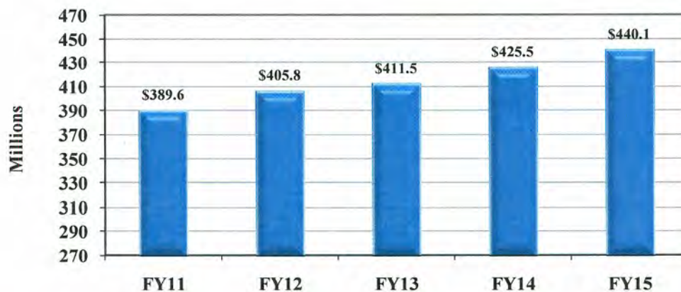
MWRA Sewer Rate Revenue Requirement

The graph below illustrates the sewer Rate Revenue Requirement for the past 5 years. The change from FY13 to FY15 is primarily the result of increased debt service related to the rehabilitation and capital improvements of the sewer system.