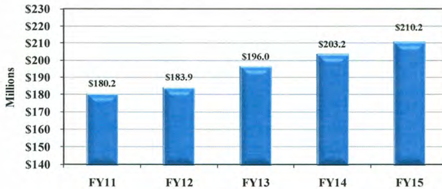
MWRA Water Rate Revenue Requirement

The graph below illustrates the water Rate Revenue Requirement for the past 5 years. The changes from FY14 to FY15 are primarily the result of increased debt service related to the rehabilitation and capital improvements of the water system.